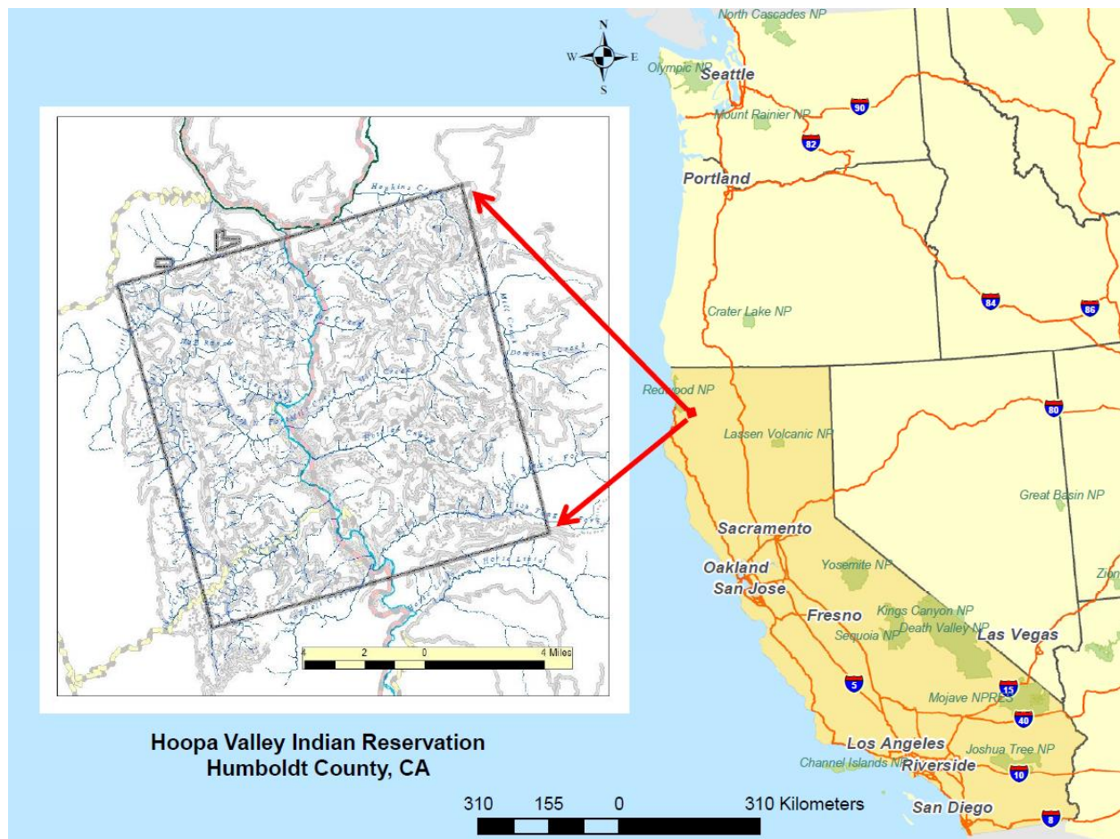
Map 1. Location of the Hoopa Valley Indian Reservation, Humboldt County, CA. The reservation is approximately 144 square miles (12x12 miles) and has over 600 miles of roads within 90,676 acres of mostly forested land.